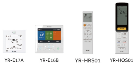
YR-E17A YR-E16B YR-HRS01 YR-HQS01